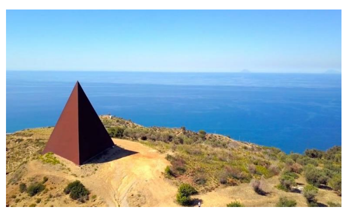
Piramide al 38° parallelo (Mauro Staccioli - 2010)

• h 17.30: End of the visit and return to Villa Margi